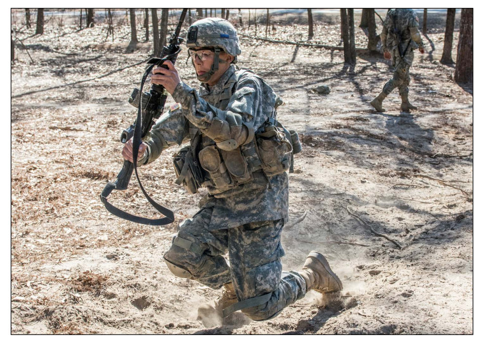
A Soldier in Basic Combat Training with C Company, 1st Battalion, 61st Infantry Regiment uses a three to five-second rush to bound to the next overwatch position on the hand grenade assault course at Fort Jackson, S.C.

(1) Keep the distance short to avoid accurate enemy fire.